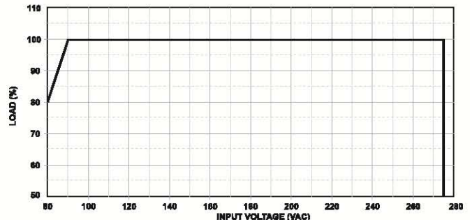
(FIG.1) INPUT VOLTAGE DERATING CURVE